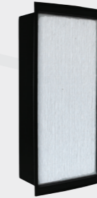
MediaMax &amp; HepaMax